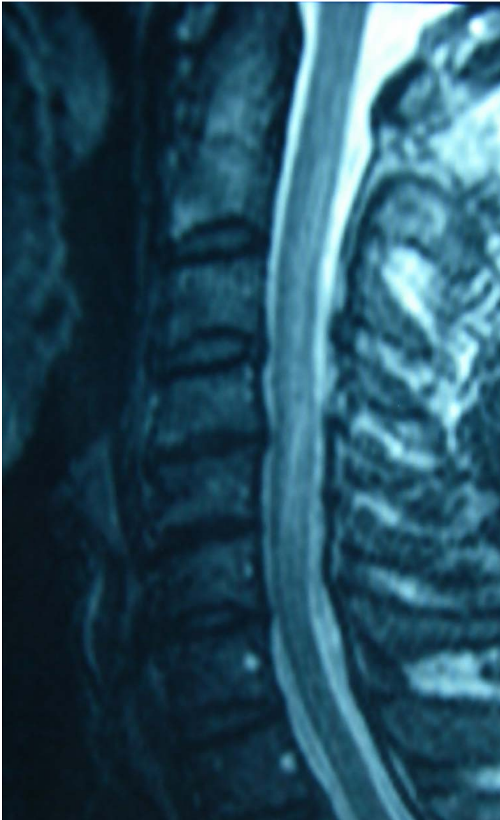
Fig. 1a - Sagittal T2-weighted image of cervical spinal cord (case 7) revealing a hyperintense signal extending from C2 level to the caudal C6 level (white arrows). The picture indicates several disks protrusions with encroachments of epidural space (arrows with dottle line).